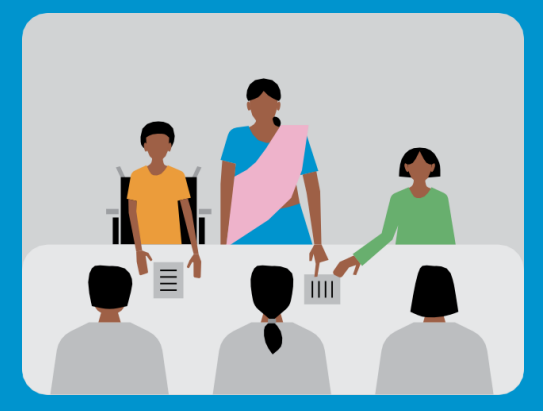
An illustration depicting participatory planning processes with women and girls with and without disabilities as stakeholders.

Owing to the limitations of the scope of this study, this policy brief does not specifically cover the needs and challenges faced by vulnerable groups such as elderly persons, single parents, people living in extreme poverty and in informal settlements, those facing caste- and religion- based discrimination, sexual and gender minorities including people from LGBT groups, migrants among other such groups. There are significant challenges faced by them, particularly, in the context of access to safe and affordable housing, rental housing discrimination, lack of employment opportunities, barriers to political participation and access to public facilities such as healthcare, child-care, elder care, education and sanitation facilities among others. Each of these groups requires specific consideration and further, careful research to develop targeted interventions for their inclusion and representation in urban development priorities.